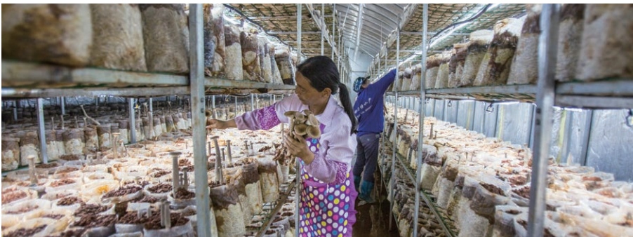
中国信保支持开展的菌菇 种植项目 Mushroom planting project carried out with the support of SINOSURE