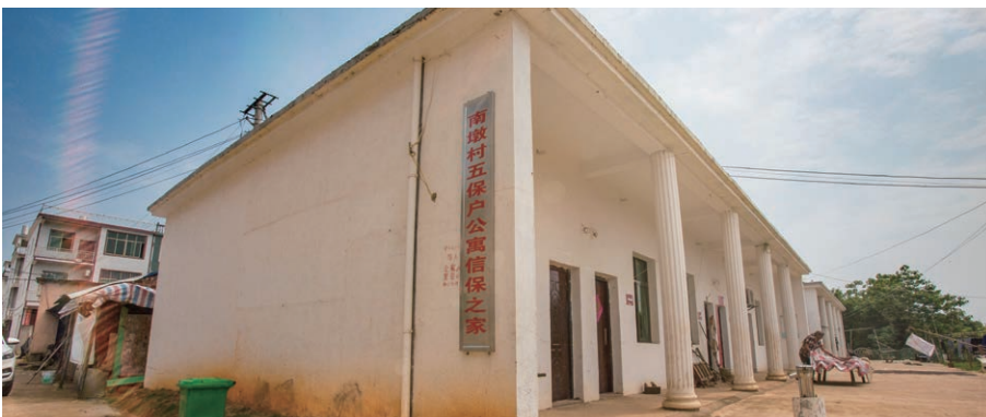
中国信保支持建设的五保户 老年公寓 Elderly apartments built for households enjoying five guarantees (guaranteed food, clothing, medical care, housing and burial expenses by communes) with the support of SINOSURE