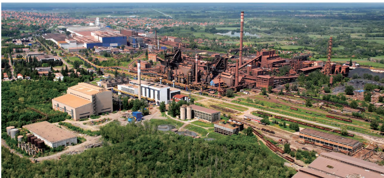
中国信保与塞尔维亚出口信用保险署在河北钢铁塞尔维亚钢厂保单项下开展再保险分入 SINOSURE and Serbian Export Credit and Insurance Agency (AOFI) provided reinsurance service under the policy of HBIS’ steel mill in Serbia

SINOSURE continuously pushed ahead and participated in the international organization of Berne Union (International Union of Credit and Investment Insurers) and its governance. SINOSURE was actively involved in the management and decision-making of the Union, and the Company’s representative was elected Vice President of Berne Union for the first time.