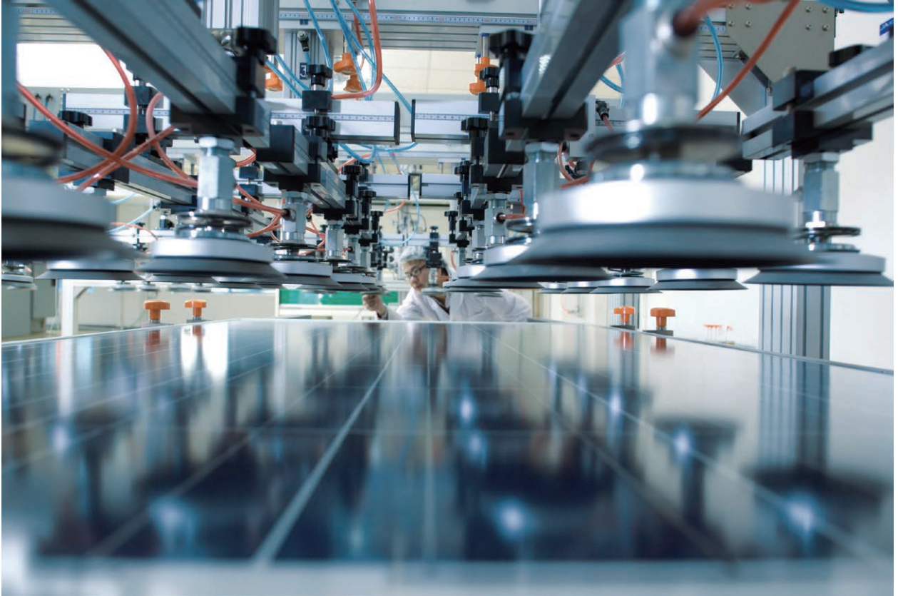
中国信保与中国银行、意大利国家电力公司合作支持的巴西新能源项目 SINOSURE cooperated with Bank of China and Enel S.p.A to support Brazilian new energy projects

积极服务第三方市场合作，与中国银行、意大利国家电力公司共同支持7个巴西新能源项目，涉及承保金额约3亿美元。此外，还分别与瑞士地中海航运公司和法国巴黎银行，及美国花旗银行和爱依斯电力公司等签署三方合作协议，开展第三方市场务实合作。